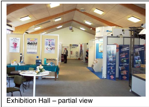
Exhibition Hall – partial view

The exhibition will be held in combination with the 7. European Bioethanol Technology-Meeting and the 62. Starch Convention from April 12 - 14, 2011 in the exhibition hall of the Association of Cereal Research, Detmold, Schützenberg 10, Phone: 0049 5231 61664-0, Fax: 0049 5231 20505, E-Mail: info@agf-detmold.de.